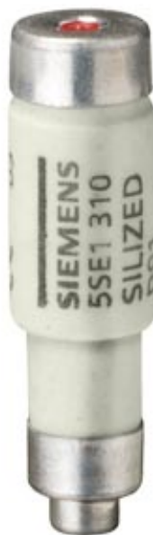
SILIZED FUSE LINK 400 V GR, SEMICOND. PROTECT. GR. D01 16 A